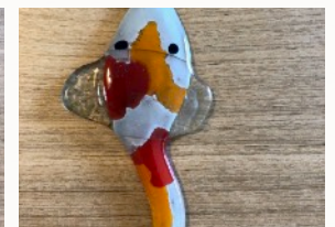
Unusual Glass pieces