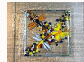
Extra Large Plates and Bowls