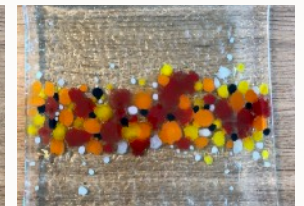
Large Glass Plates